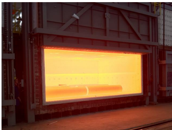
Chamber forging furnace